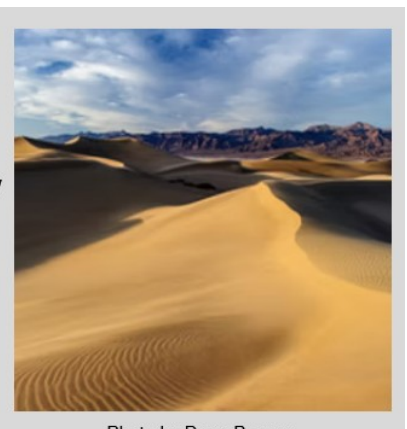
April 12th 1:00 - 3:00 pm Opening Reception for the new OCAC art exhibit at North Gallery, Ontario County Historical Society Museum 55 N. Main St. Canandaigua