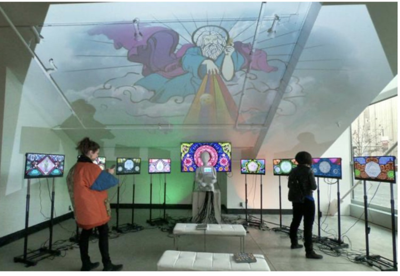
"The Little Chapel of Our Holy Motherboard" at The Understudy in Denver, CO 2018

I am very proud of my public art works, whether it is the large bronze sculptures or my digital projected pieces. Being in public collections means many people get to enjoy them. I am also very proud of a large digital installation I did called "The Little Chapel of Our Holy Motherboard". It was an ambitious work that turned out really well and I was able to install/show the piece in Santa Fe and Denver.